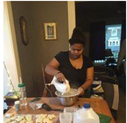
Our resident volunteers