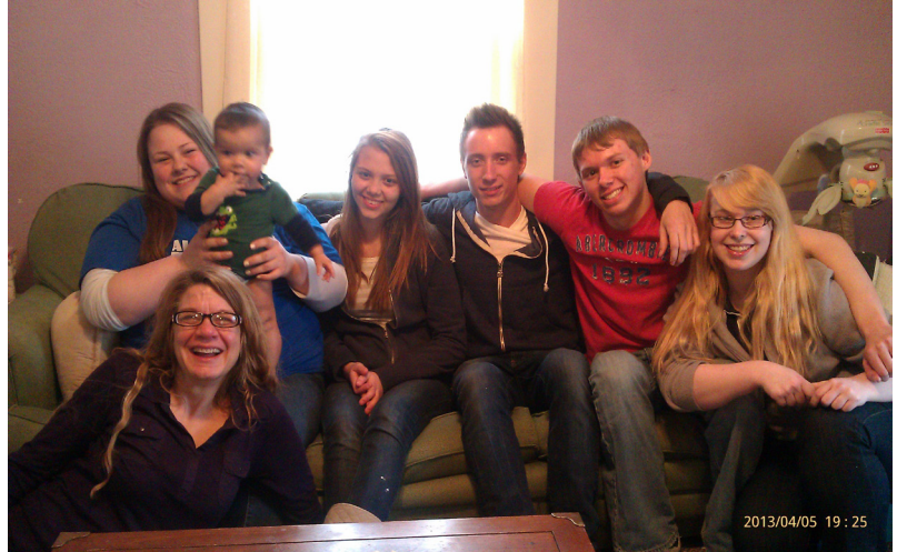
AmeriCorps- Alternative Break