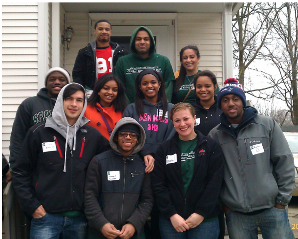
MSU Global Service Day