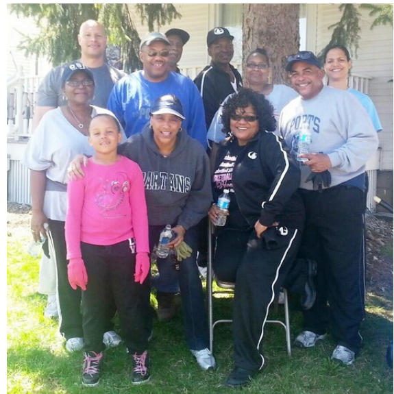
Pilgrim Rest Baptist Church